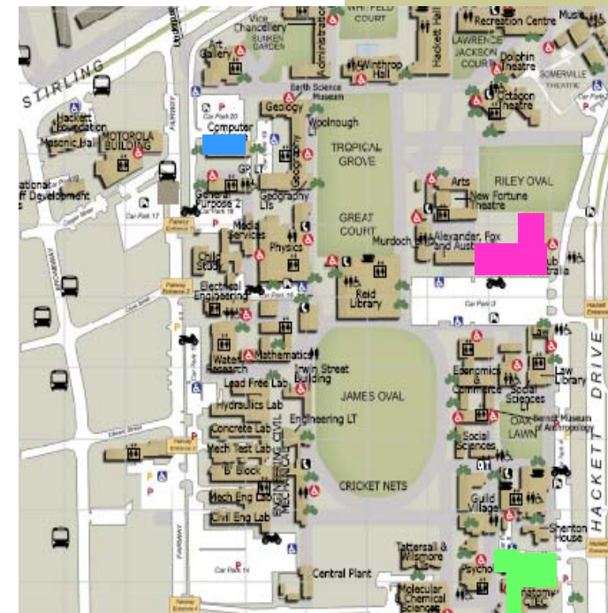
UWA Club (pink) CTEC (green) Computer Science Building (blue)

Parking: We have been allocated 5 reserved parking bays in Car Park 3. If you require a car park please let me know as soon as possible and I can organize a pass.